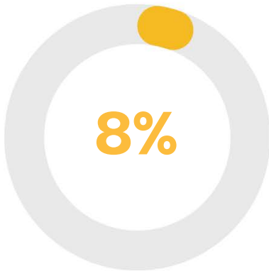
Social Impact Investment